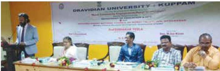
The Hon'ble Vice-Chancellor delivering the inaugural address

One day workshop on Rural Community Engagement was conducted at Dravidian University, Kuppam on 24th April.