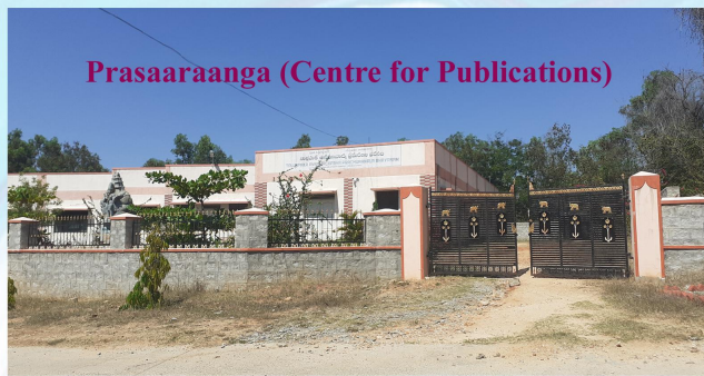
Prasaaraanga (Centre for Publications)