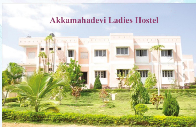
Akkamahadevi Ladies Hostel