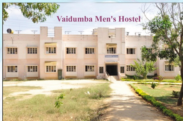
Vaidumba Men's Hostel