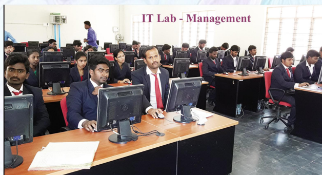
IT Lab - Management