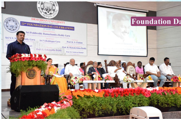
Foundation Day Celebrations - 2019