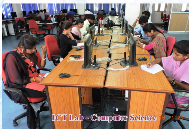
ICT Lab - Computer Science 16-11-29