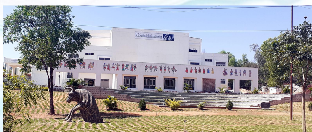
M.S. Subbulakshmi Auditorium