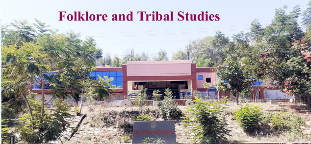
Folklore and Tribal Studies