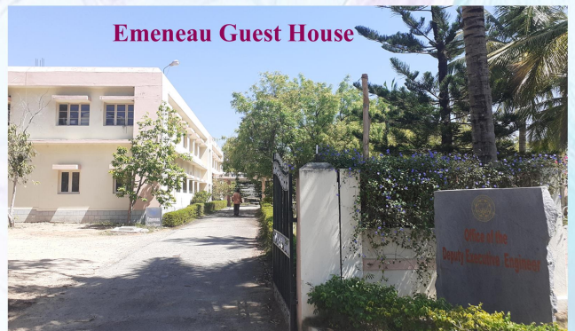
Emeneau Guest House