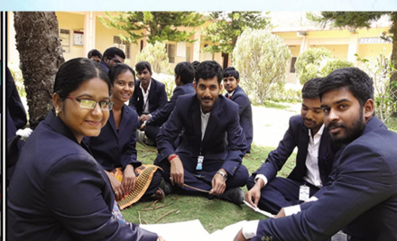
Learning in Groups