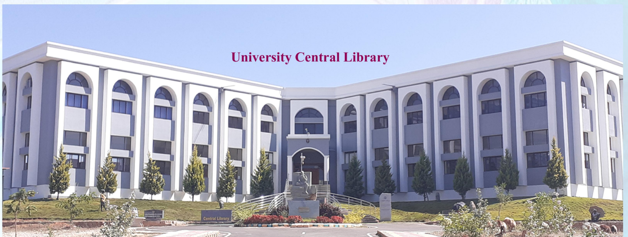
University Central Library